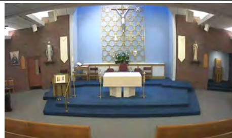
(screenshot of St. Pius X Church "Live Streaming")

St. Pius X Church Masses and Adoration are streamed live to our website